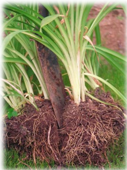
Time to divide those daylilies