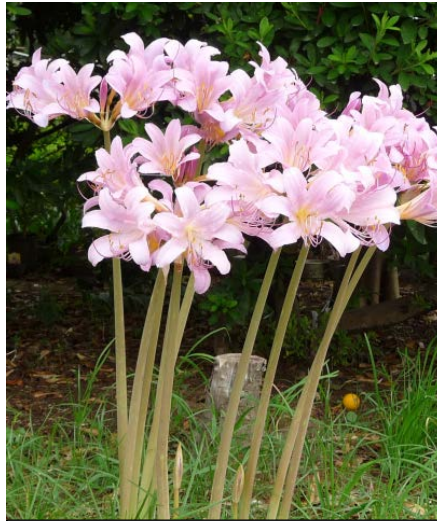
Lycoris squamigera 'Naked Ladies'

Naked Ladies are an August delight, popping up throughout yards in the Midwest and Southern US. Also known as surprise lilies , nekkid ladies , resurrection lilies , magic lilies , or hardy amaryllis , the lycoris squamigera is in the amaryllis family, and is believed to have originated in Japan or China. In June, elongated leaves sprout and grow, then die back. In mid-late summer, flower buds appear and, within 4-5 days, are in full bloom on long, leafless stems. The fragrant, large multi-blooms will only last a few days, but will be back next year.